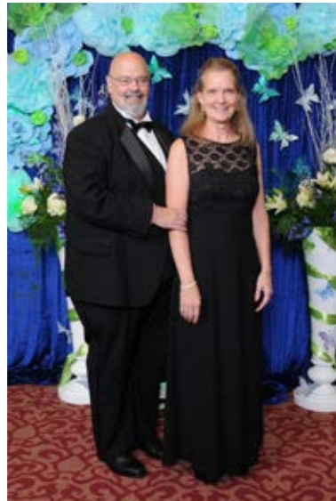
LEFT The festivities at the 2021 Covenant Kids Gala were enjoyed by many.

Keeping within its philanthropic goals, the Volunteer Advisory Board supported a number of hospital endeavors. Covenant HealthCare Volunteers were a major sponsor of the Covenant Kids Gala, Mary Free Bed at Covenant and again supported the Breast Health Center through the purchase of calendars for patients and staff.